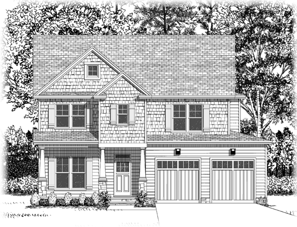
Elevation B ~2623 sq.ft.