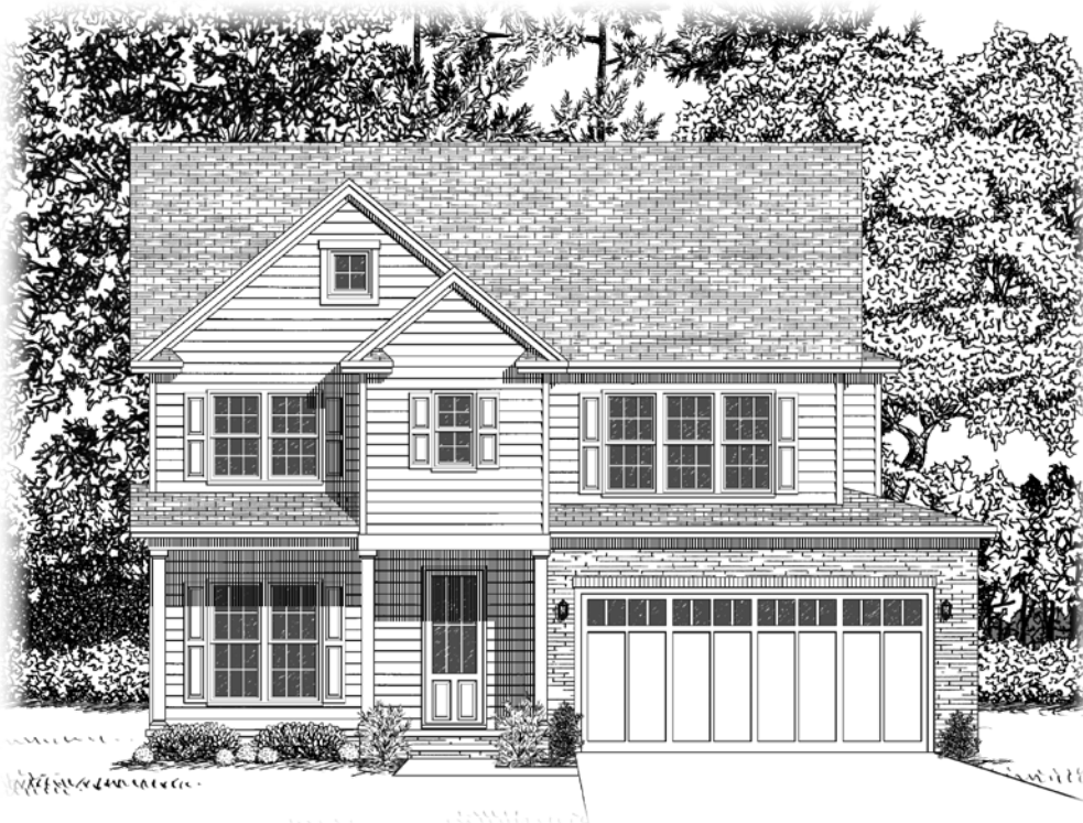
Elevation C ~2623 sq.ft.