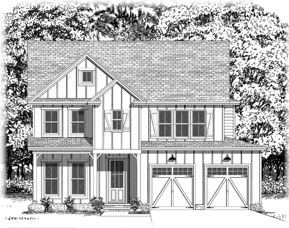
Elevation A ~2623 sq.ft.