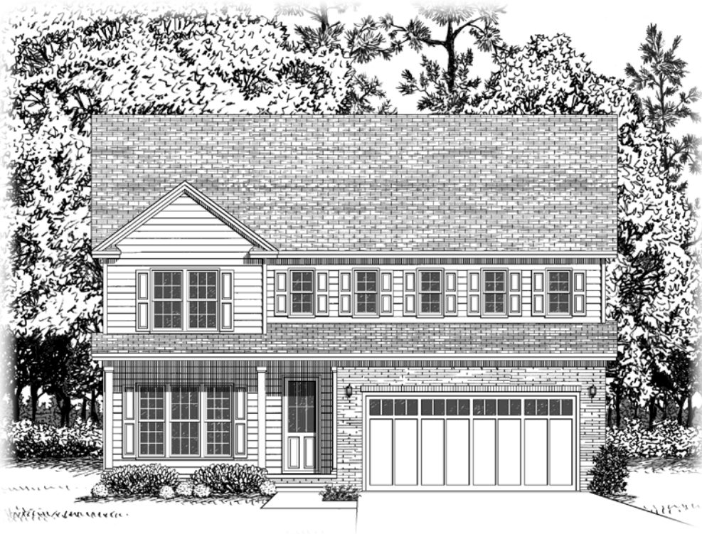
Elevation C ~2798 sq.ft.