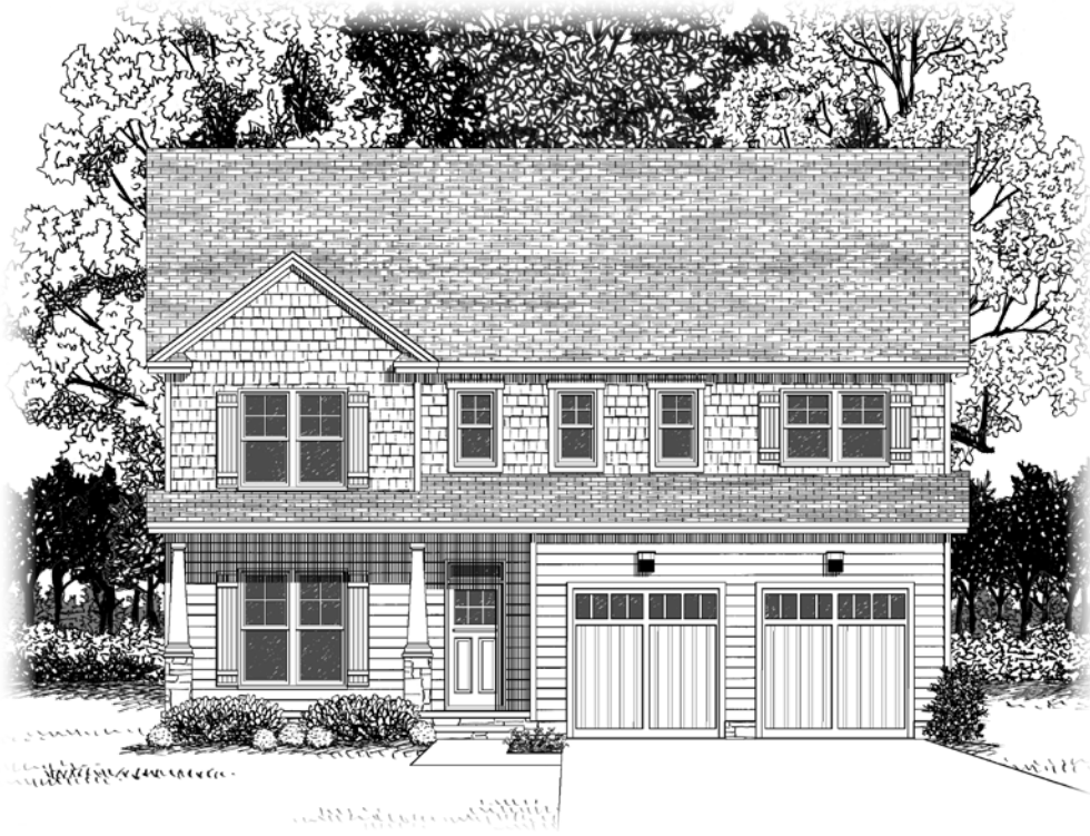
Elevation B ~2798 sq.ft.