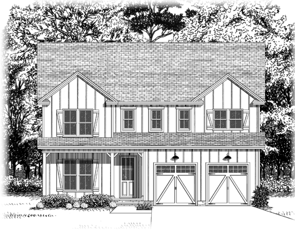
Elevation A ~2798 sq.ft.