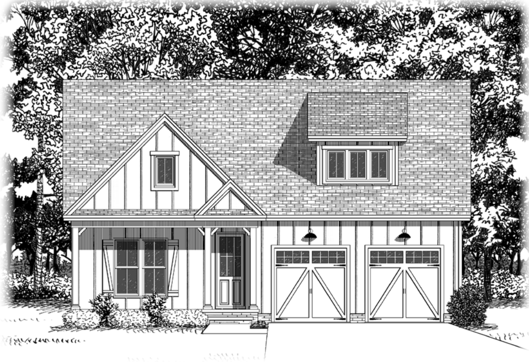
Elevation A ~2488 sq.ft.