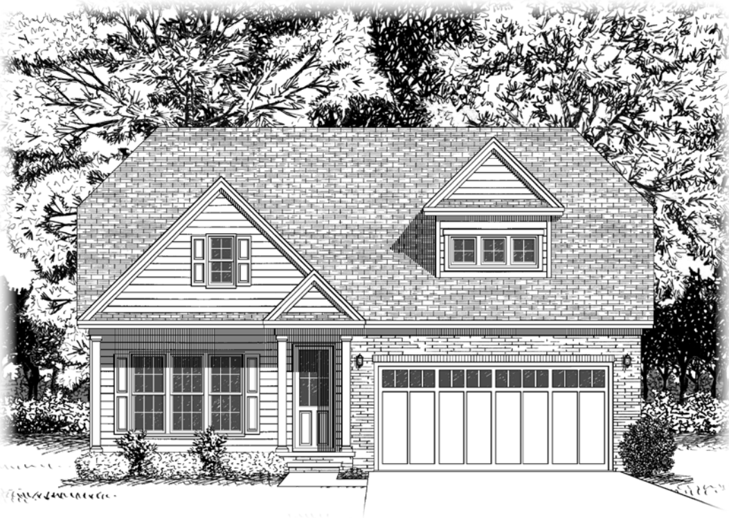
Elevation C ~2488 sq.ft.