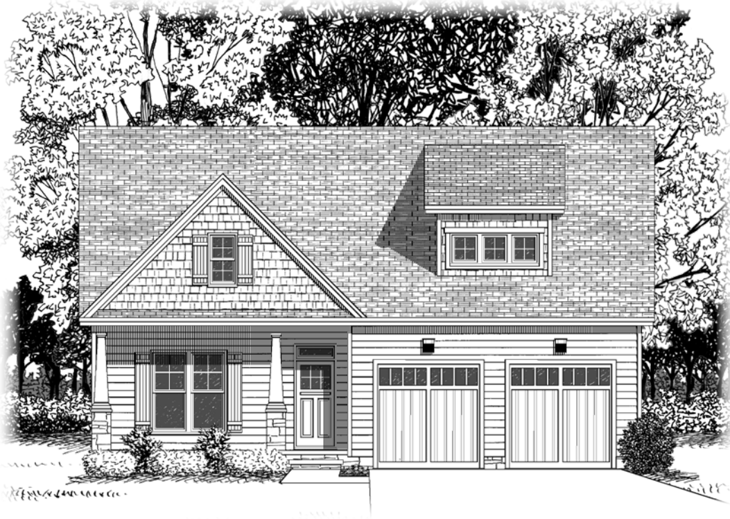
Elevation B ~2488 sq.ft.