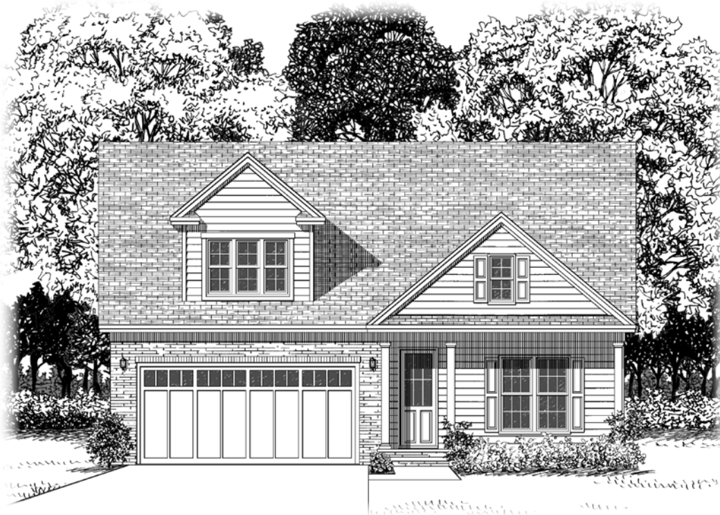
Elevation C ~2696 sq.ft.