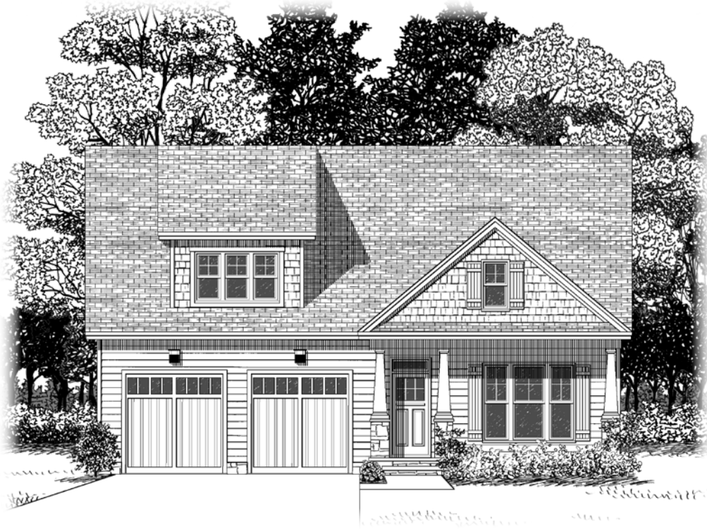
Elevation B ~2696 sq.ft.