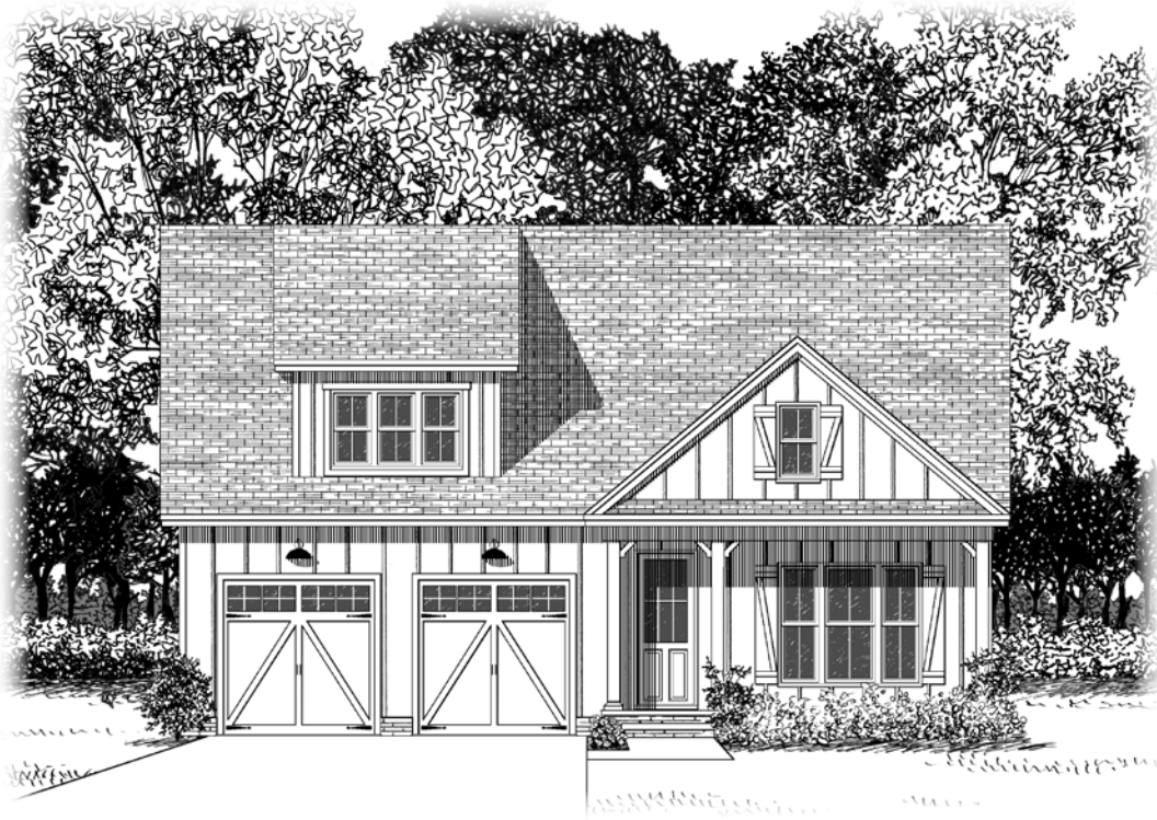
Elevation A ~2696 sq.ft.