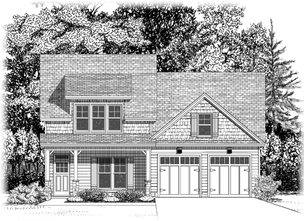
Elevation B ~2744 sq.ft.