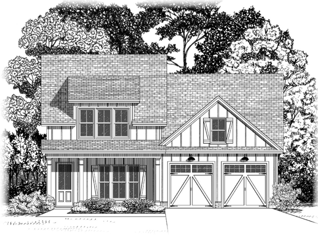
Elevation A ~2744 sq.ft.