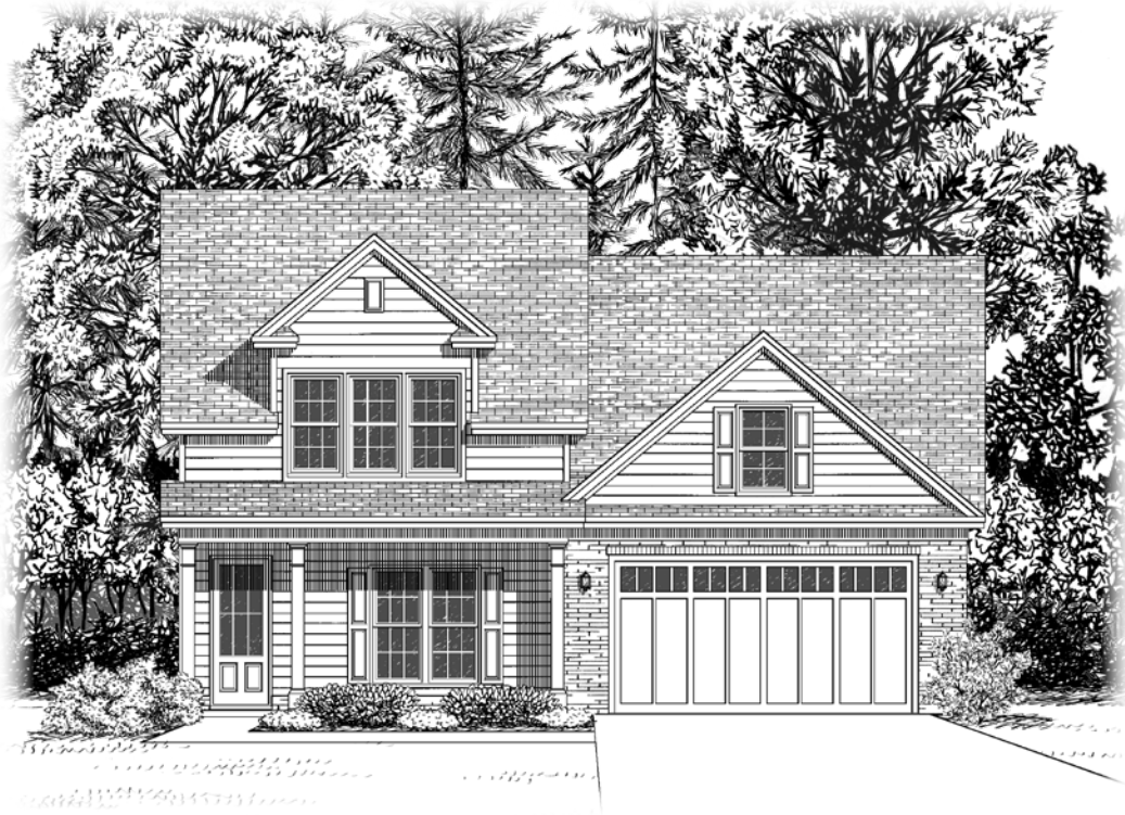
Elevation C ~2744 sq.ft.