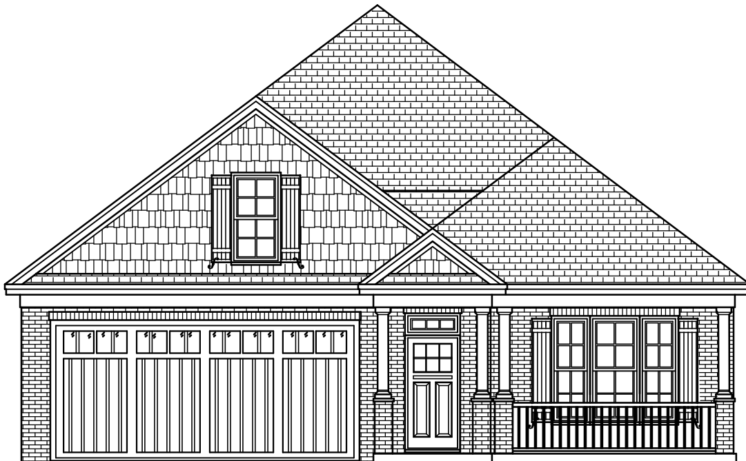
THE ASHE "C"