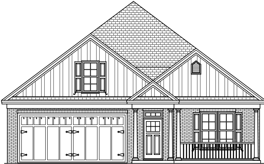
THE ASHE "B"