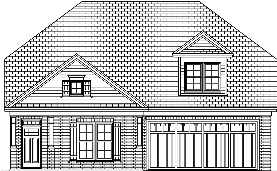
THE MACON "B"