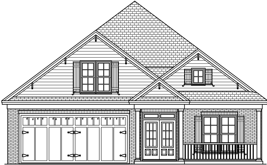
THE COLUMBUS "B"