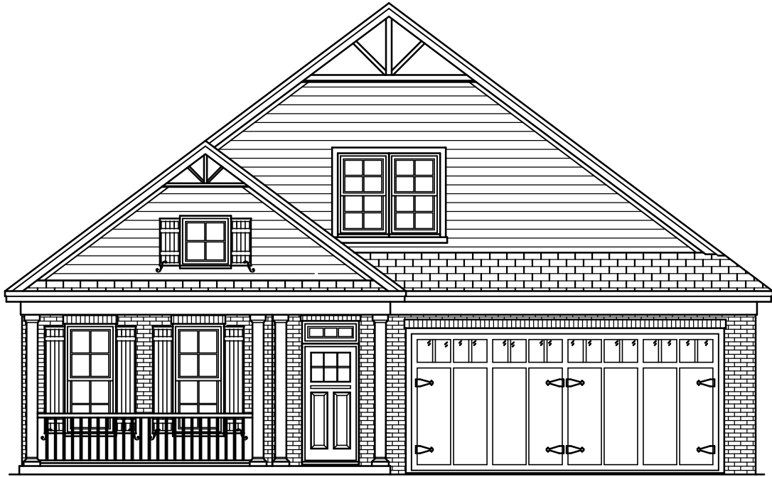
THE BOONE "B"